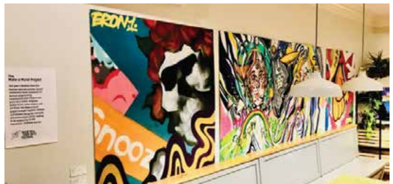
Make-A-Mural Project Exhibit featuring works made at this years festival

The gallery space at The Elm Cafe is curated by the Skeleton Park Arts Festival. Exhibits run seasonally. If you would like to apply visit skeletonparkartsfest.ca/elm-cafe-gallery