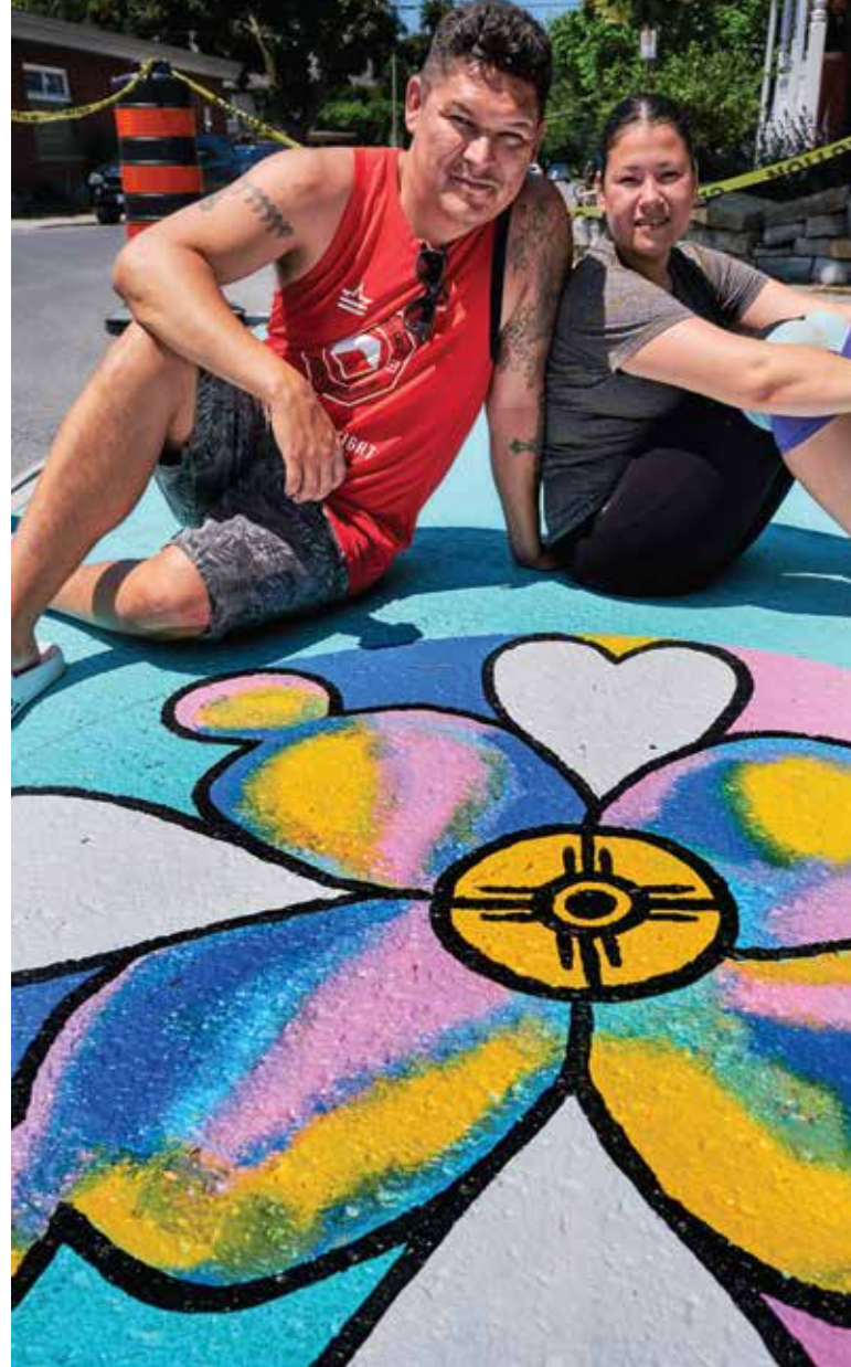
Mural Photos Credit: Al Bergeron